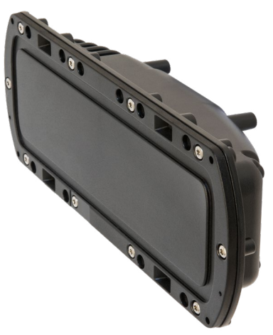
The AGD 343 Highways Monitoring Radar

One of the core challenges posed by the Canadian Highways Division was that the highway (which spanned almost 90 metres) comprised of multiple lanes in both directions, divided by a large, grassed median. Being able to set the radar to accommodate an elevation difference of over one metre between the north and southbound lanes was also vital.