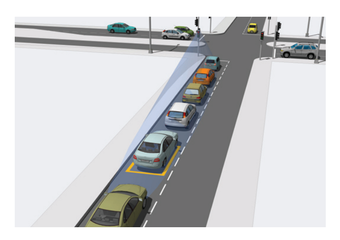
Traffic & Pedestrian Control