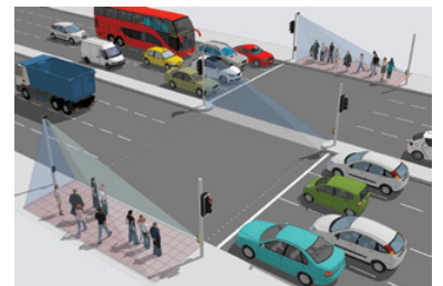
Traffic & Pedestrian Control