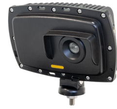
The AGD 650 Dual Zone Stop-line Detector - Delivering robust vehicle detection data at the stop-line of multi lane approaches

"During the development of the 650, our focus was ensuring accuracy of detection which – during the trials – has been shown to support the smooth running of traffic and reduce unnecessary wait times."