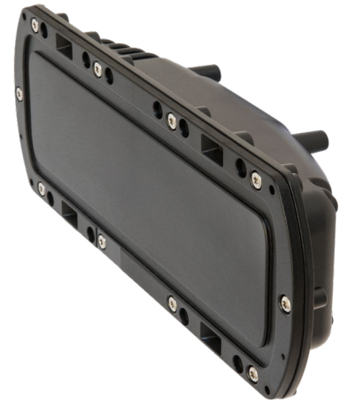
The AGD 343 Highways Monitoring Radar

One of the core challenges posed by the Canadian Highways Division was that the highway (which spanned almost 90 metres) comprised of multiple lanes in both directions, divided by a large, grassed median. Being able to set the radar to accommodate an elevation difference of over one metre between the north and southbound lanes was also vital.