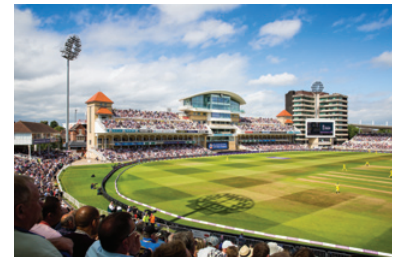
World Cup cricket game, summer 2019, © Nottinghamshire County Cricket Club

The volumetric capability of the 645 Pedestrian Detector allows for real-time dynamic adjustments to pedestrian green time