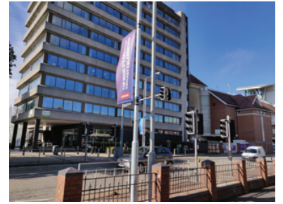
Newly installed crossing close to Trent Bridge stadium on the busy A6520 Radcliffe Road